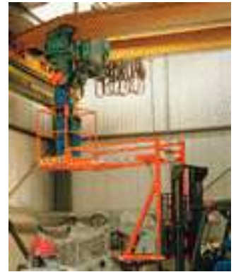
For working over Machinery/Objects